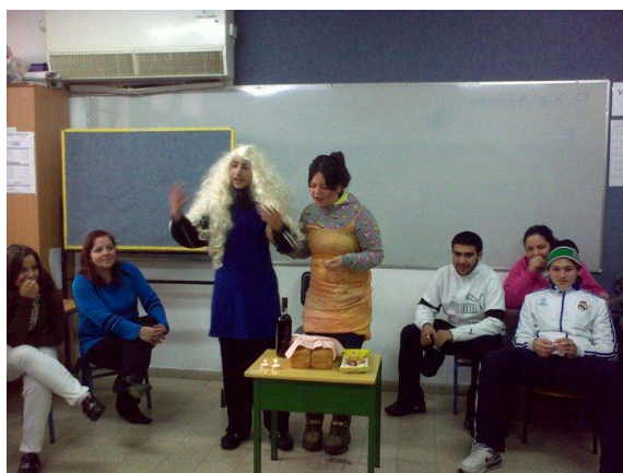
Lihi's students in a comic relief – presenting to the special needs class they adopted

wonderful to see them playing with the kids and making them happy. These activities create a break from our schoolwork routine. The students are so satisfied and motivated by this activity; they are so happy to be doing so much good for others!"