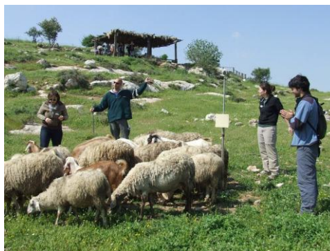
TFI's teachers in an ODT leadership activity in Ne'ot Kdumim Biblical Landscape Reserve.

TFI's teachers had a tailored leadership outdoor activity in Ne'ot Kdumim at the start of their Passover break. The teachers participated in several activities that led to reflections and discussions on leadership in their classrooms. The bow and arrow was followed by a discussion about targets - how to define and reach targets and what we can learn from missing them. The teachers also herded sheep which illuminated various types of leadership and the challenges and opportunities associated with being in a leadership role and engaging followers. The teachers expressed their eagerness to use the insights from these activities in their classrooms, and were pleased to be able to think creatively and spend time together learning from peers and recommitting to our mission. The success of yesterday reaffirmed the need to continue investing in developing a strong cohort culture and ongoing professional development.